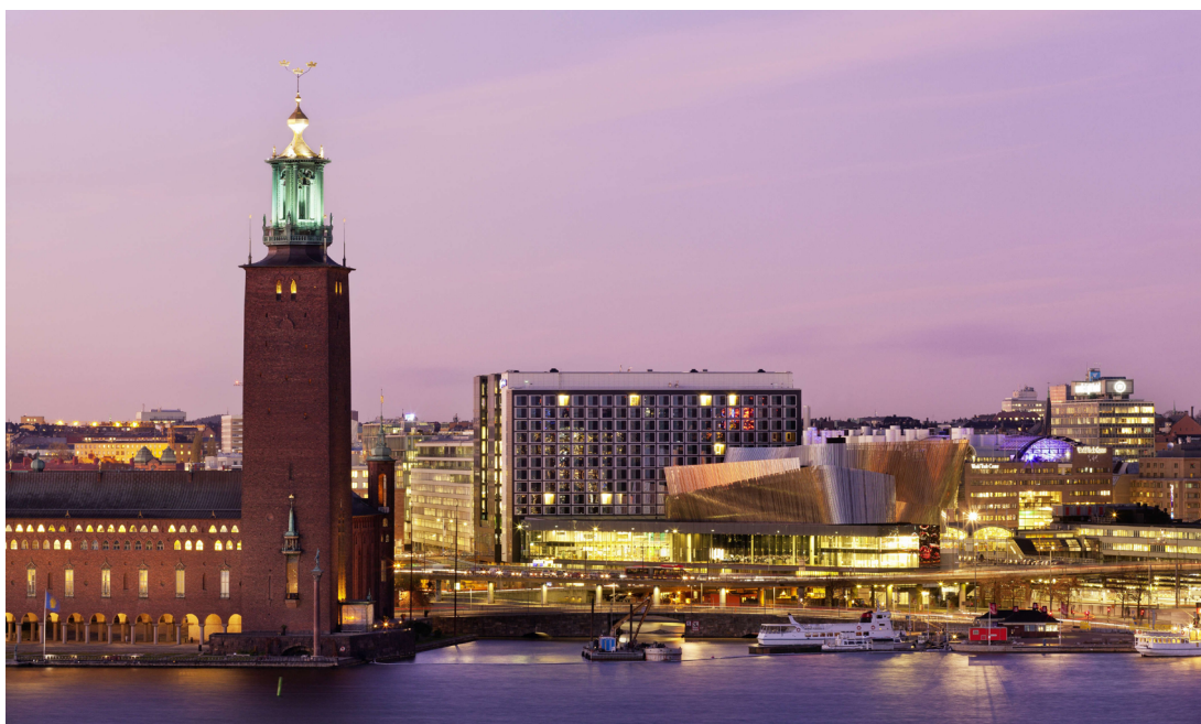
Stockholm City Hall, the venue of the Congress reception, and Stockholm Waterfront Congress Centre

The Congress will attract leading aviation experts, engineers, scientist and Ph.D. students from all over the world.